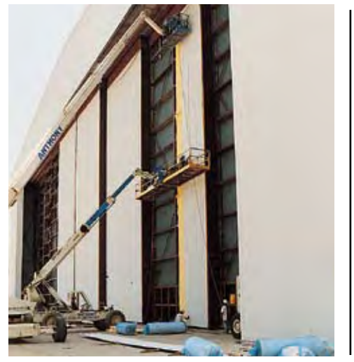
During construction (photos above and at left) the massive components of the huge building dwarfed the men working on it.