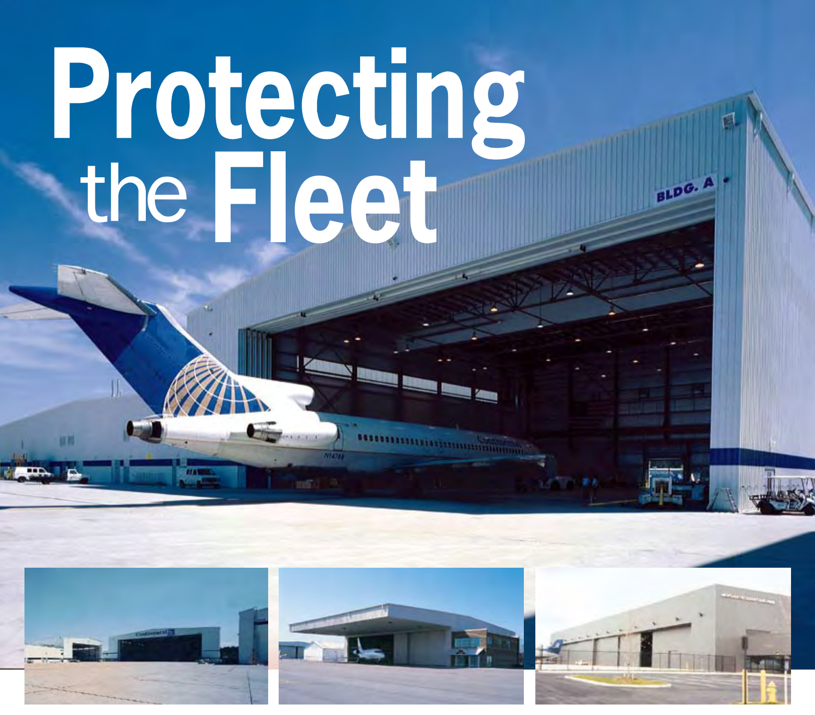
Continental Airlines' new maintenance facility in Houston. Texas